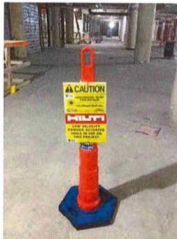
Post safety signage