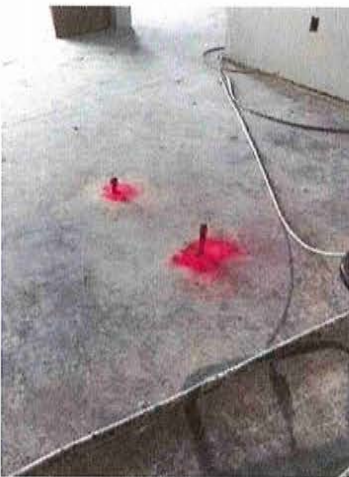
PAINT trip hazards