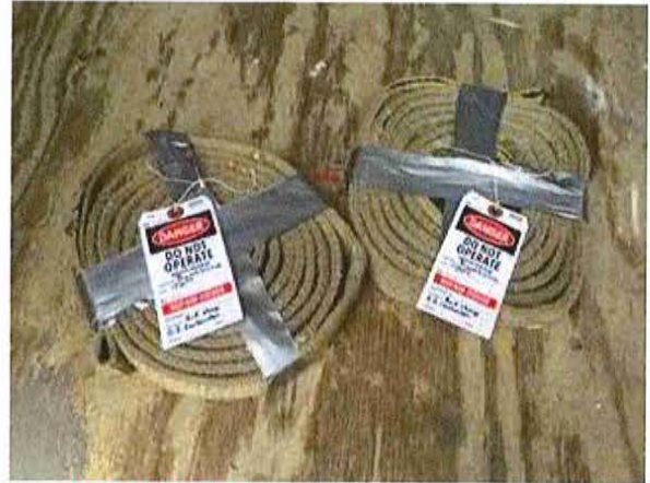
RED TAG damaged equipment