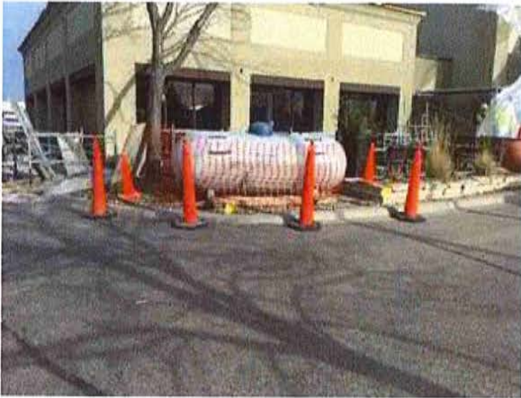
Protect our LP tanks from traffic