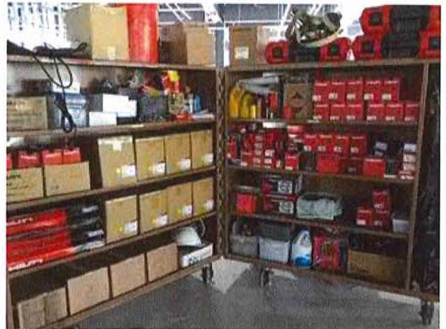
Organized gang box