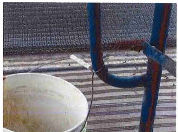
Tie wire to secure a pail from falling from a scaffold