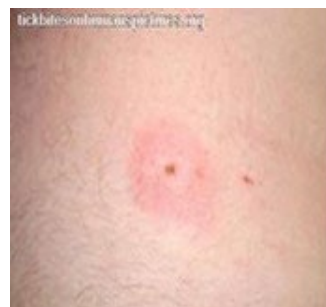
the red bulls eye mark they can leave on your skin after a bite