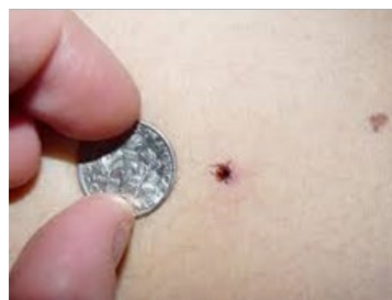
the size of the adult deer ticks