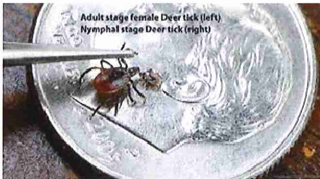
the size of the adult deer ticks