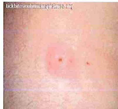
the red bulls eye mark they can leave on your skin after a bite